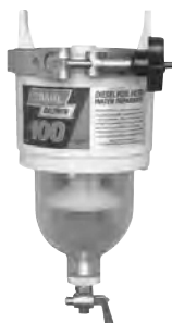
MODEL 100 Diesel Fuel Filter/Water Separator