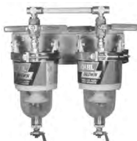
MODEL 100-MFV Double Manifold Diesel Fuel Filter/Water Separator with Shut-Off Valves for Continuous Operation