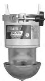
MODEL 100-M Marine Diesel Fuel Filter/Water Separator