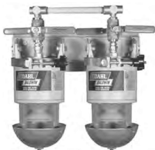
MODEL 100-MMV Double Marine Manifold Diesel Fuel Filter/Water Separator with Shut-Off Valves for Continuous Operation