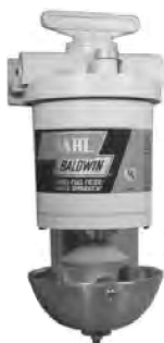
MODEL 150-M Marine Diesel Fuel Filter/Water Separator