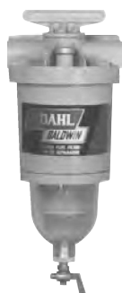
MODEL 150 Diesel Fuel Filter/Water Separator