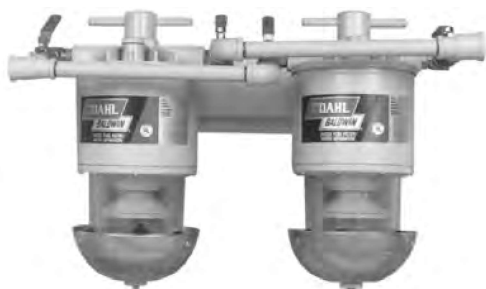
MODEL 200-MMV Double Marine Manifold Diesel Fuel Filter/Water Separator with Shut-Off Valves for Continuous Operation