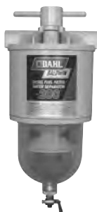
MODEL 200 Diesel Fuel Filter/Water Separator