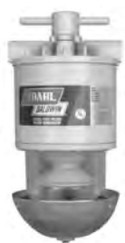
MODEL 200-M Marine Diesel Fuel Filter/Water Separator