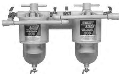
MODEL 200-MFV Double Manifold Diesel Fuel Filter/Water Separator with Shut-Off Valves for Continuous Operation