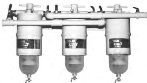
MODEL 300-MFV3 Triple Manifold Diesel Fuel Filter/Water Separator with Shut-Off Valves for Continuous Operation