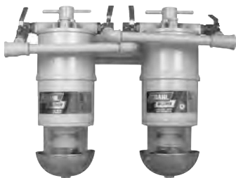
MODEL 300-MMV Double Marine Manifold Diesel Fuel Filter/Water Separator with Shut-Off Valves for Continuous Operation