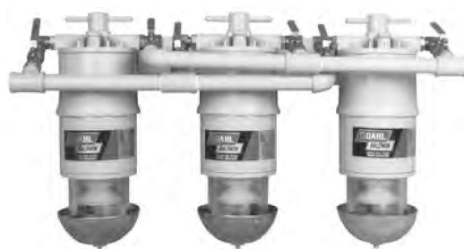
MODEL 300-MMV3 Triple Marine Manifold Diesel Fuel Filter/Water Separator with Shut-Off Valves for Continuous Operation