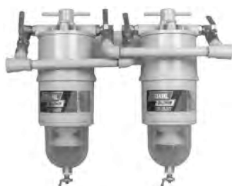
MODEL 300-MFV Double Manifold Diesel Fuel Filter/Water Separator with Shut-Off Valves for Continuous Operation